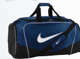
NIKE BRASILIA 4 DUFFEL SEE P. 26 FOR ALL COLORS