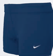
NIKE DIG SHORT (SHOWN ABOVE)