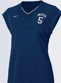
NIKE ASSASSIN JERSEY (SHOWN ABOVE)